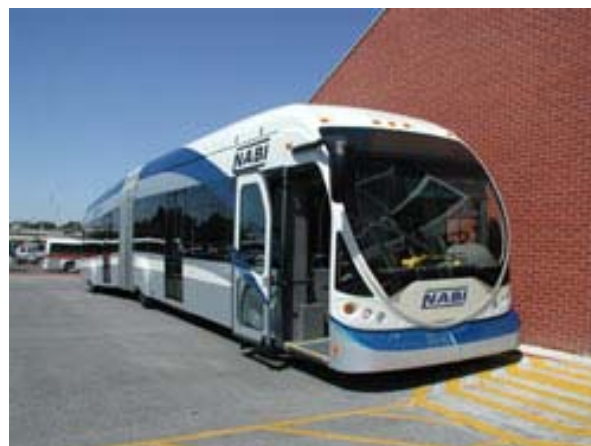
Figure 12 - Typical stylized 60-foot articulated BRT vehicle

Vehicles are one area where the state of the practice is extremely variable. The largest BRT systems in Latin America have pioneered the use of double-articulated vehicles, though most use standard 60-foot articulated vehicles. BRT and Rapid Bus systems often begin operation with more conventional vehicles, and then transition to specialized vehicles as the system grows. AC Transit and LAMTA's Rapid Bus lines began operation with 40-ft low-floor vehicles, and LAMTA has transitioned some lines to stylized 60-foot vehicles (Figure 12) as ridership has grown. In US and European practice, many systems are trending toward stylized 60-foot vehicles, such as the LAMTA's Orange Line, Las Vegas' MAX, and the Lane Transit (Eugene) system. Boston's Silver Line, in contrast, operates with standard 60-foot articulated vehicles.